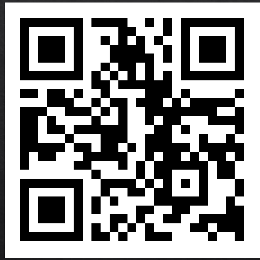
Boys State Application